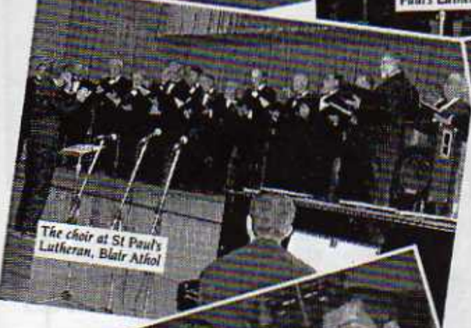
The choir at St Paul's Lutheran, Blair Athol