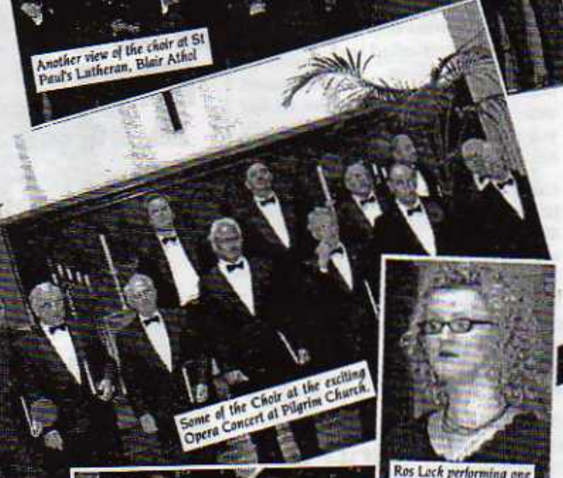
Some of the Choir at the exciting Opera Concert at Pilgrimage Church.