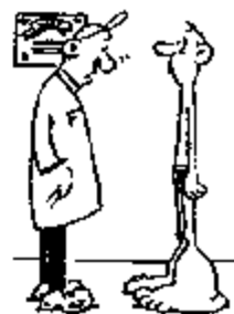
"Now breathe out!"

EXERCISE 12. Inhale slowly and deeply, then exhale as slowly as possible through the open mouth, directing the breath on to the hard palate. In doing this do not allow the upper chest to fall. Only the diaphragm and lower ribs should relax.