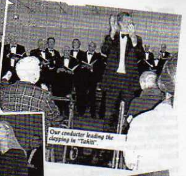
Our conductor leading the clapping in "Tahiti".