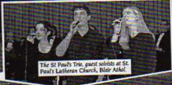
The St Paul's Trio, guest soloists at St Paul's Lutheran Church, Blair Athol.