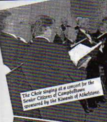
The Choir singing at a concert for the Senior Citizens of Campbelltown sponsored by the Kiwanis of Athelstone.