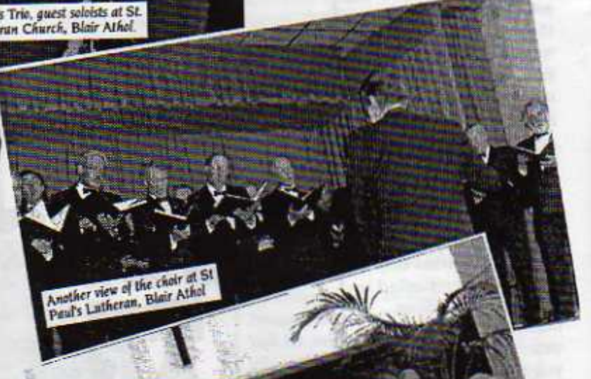
Another view of the choir at St Paul's Lutheran, Blair Athol